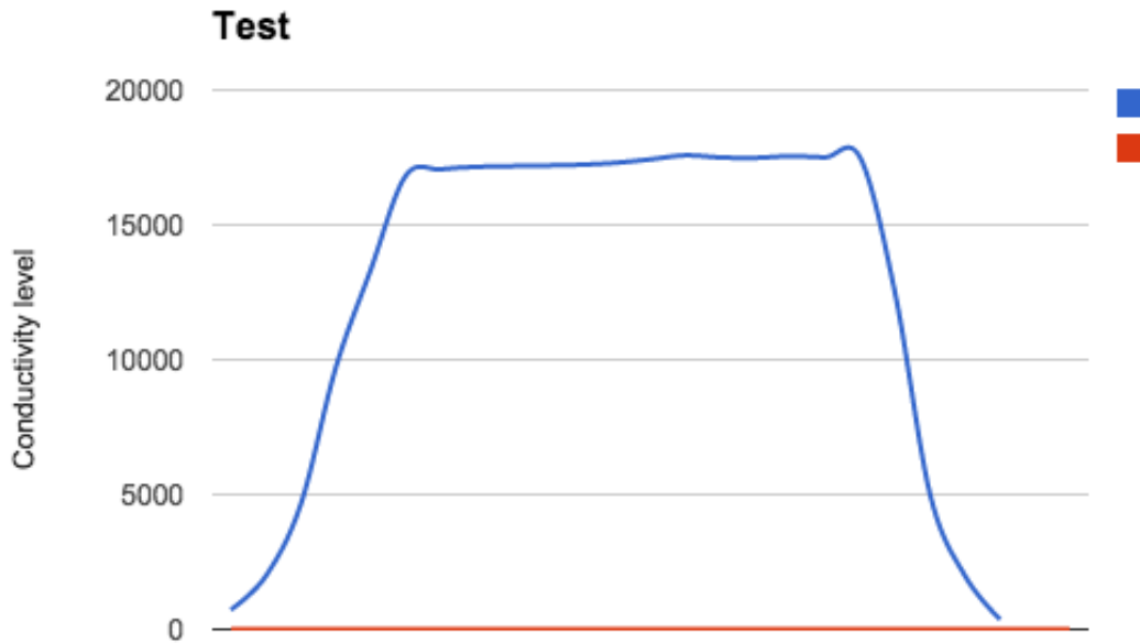
(Figure # 5. Graph of the output from the serial monitor)

As seen in Figure #5, the conductivity sensor measures the number of ions in two probes. “Blue probe” represents the tap, unfiltered water, whereas “Red probe” is filtered water. The graph shows a big contrast between the two probes. That means that the sensor can easily detect if the water was filtered and if the filter is working the way it is supposed to.